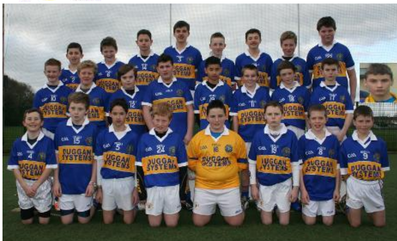
Patrickswell U-14 Hurling Panel