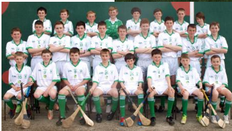
O'Loughlin Gaels G.A.A. Club, Kilkenny