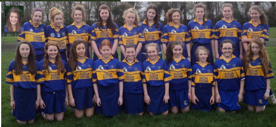
Patrickswell U-14 Camogie Panel