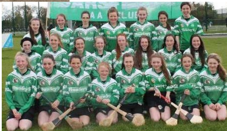
Lucan Sarsfields Camogie Club, Dublin